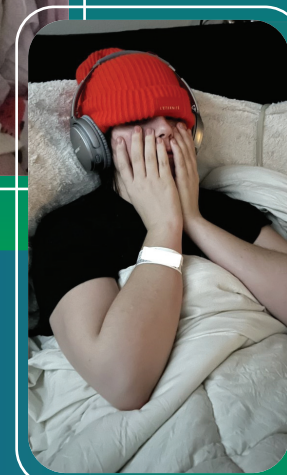
MAZ ME/CFS sufferer since 2019